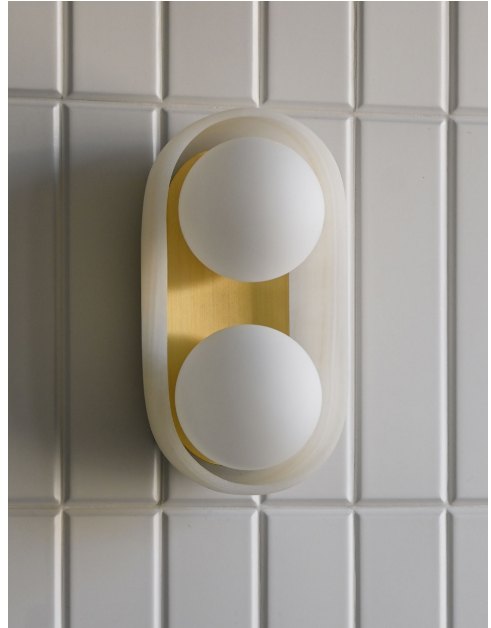
Proyecto K VE+EME Detail of DBH 02 II Wall Lamp