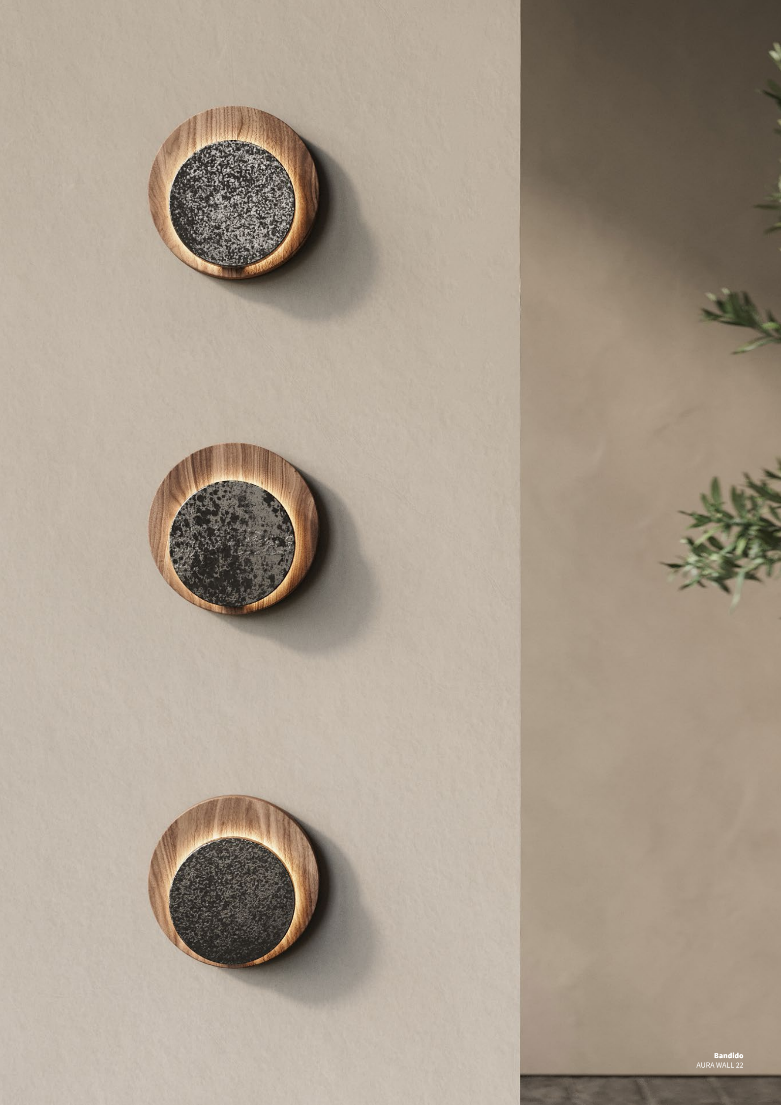
Bandido AURA WALL 22