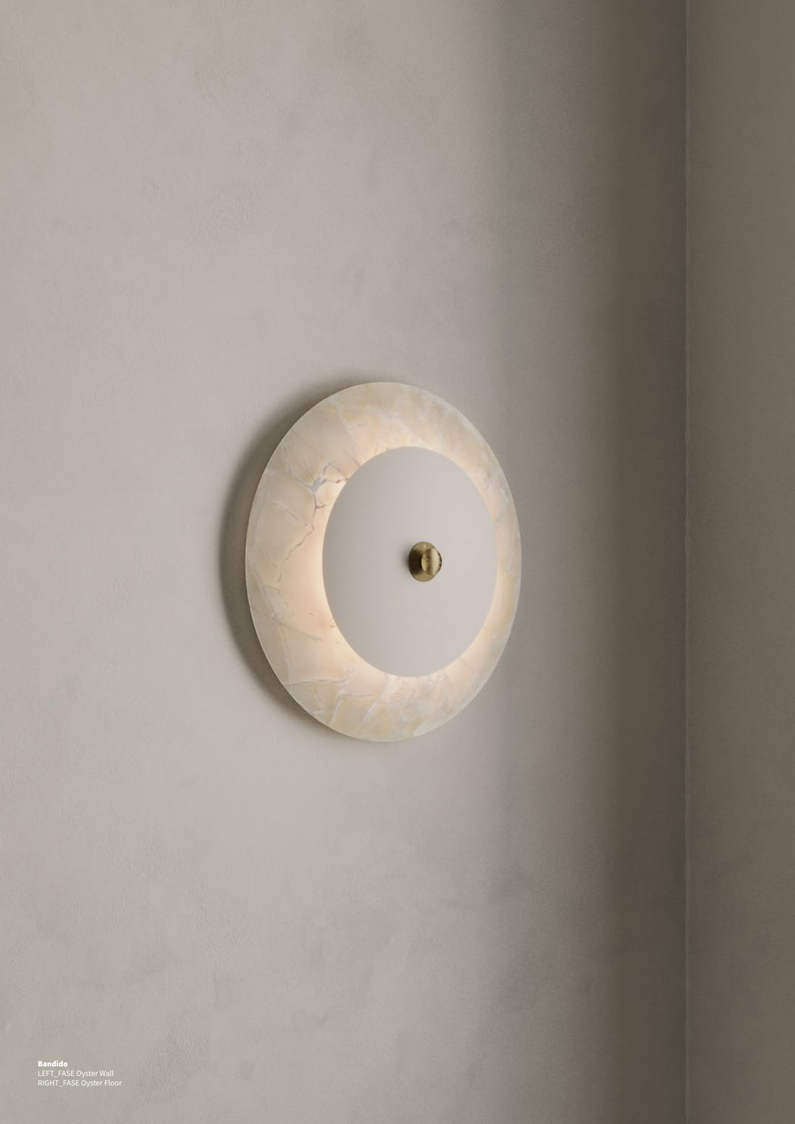
Bandido LEFT_FASE Oyster Wall RIGHT_FASE Oyster Floor